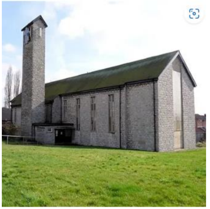
Figure 1 https://stphilip.co.uk/about-us

Heatwaves, storms, floods, wildfires, and earthquakes – what more evidence could we need to see that Planet Earth is in trouble – threatened by the very beings tasked to be its guardian? Too late we have realised that we cannot sit and wait for someone else to find a solution, we need to take action ourselves.