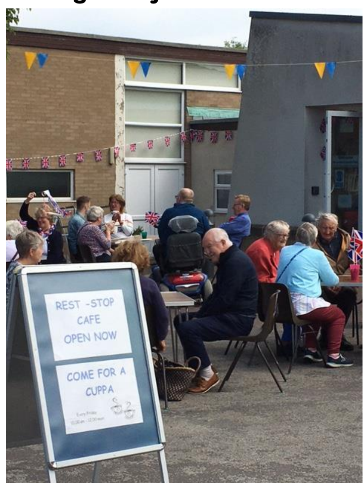
St John's Cafe celebrating the Platinum Jubilee

All Saints Cafe operates on Wednesdays 10am-12 and started from a gazebo on a small grassy patch at the bottom of the car park next to the church. Passers-by as well as church members popped in for a drink and a chat and many said it was just good to be speaking to people again.