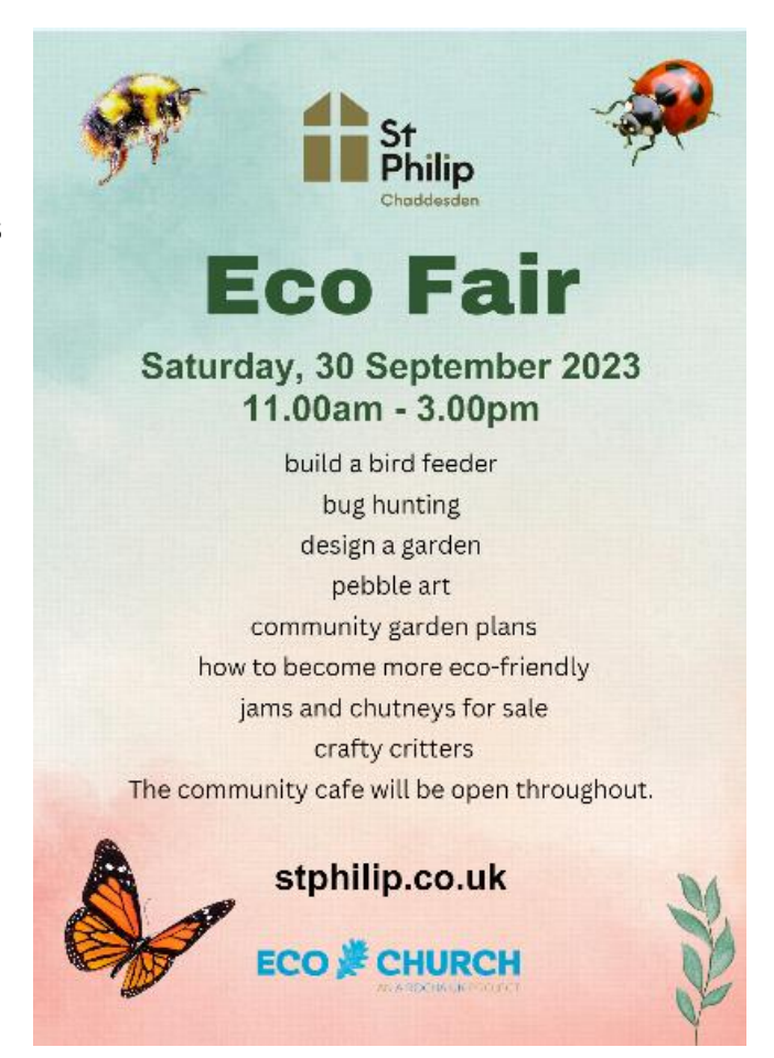
Figure 2 https://stphilip.co.uk/eco-church Advert used for the event.

The more ambitious Fair in May will allow people to check our progress on the Eco Board, look at the gardens, and see if we have been able to increase the biodiversity of the site. No pressure then!!