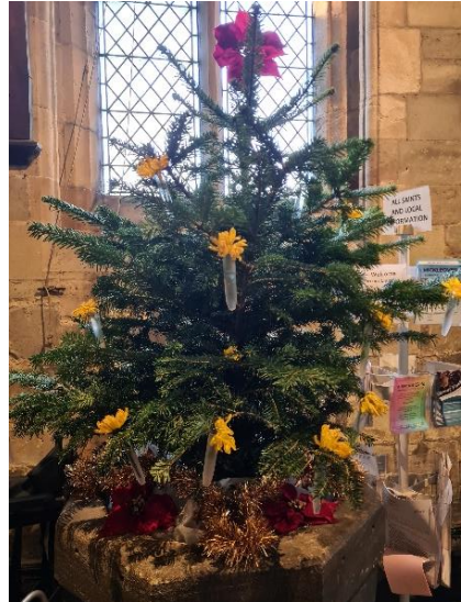
All Saints Flower Ladies