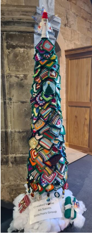
All Saints Stitchers

Below are the trees created by All Saints and St John's groups.