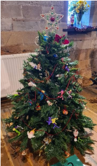
Christian Movement Group