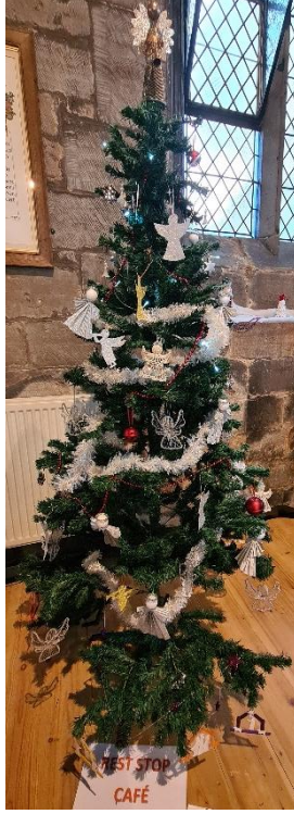
Rest Stop Café