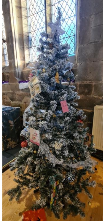
Tuesday Bible Study Group